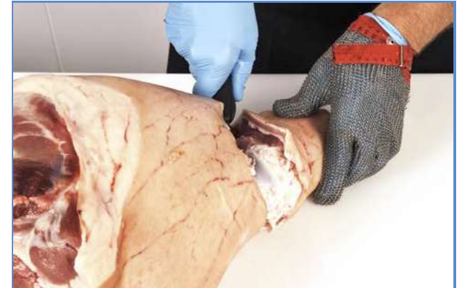
3 ... the femur and tibia/fibula