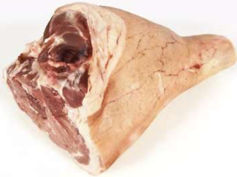
1 Leg of Pork