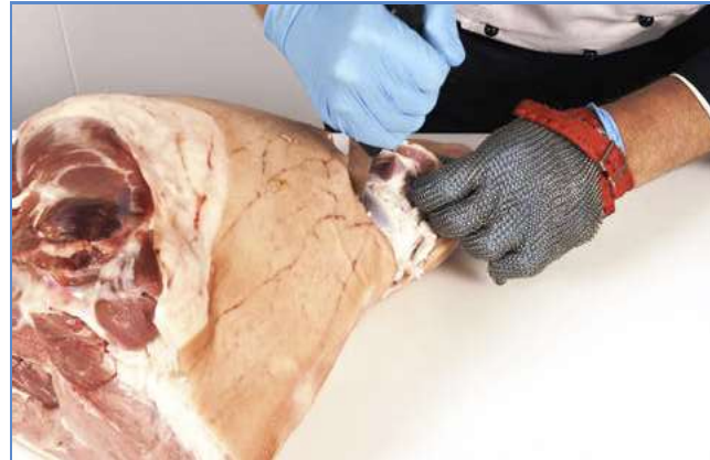
2 Remove the hock by cutting through the joint of ...